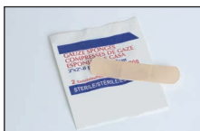
Dry gauze or adhesive bandages