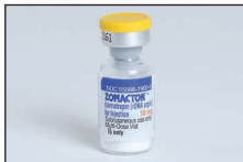
ZOMACTON™ 10 mg (powder)