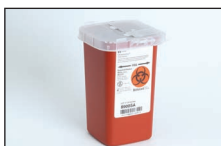
Sharps disposal container