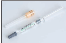
Pre-filled syringe with diluent (liquid) and mixing needle