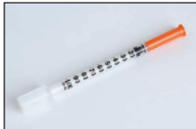
Syringe and injection needle